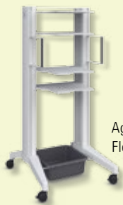
Agilent A-Line Flex Bench Rack