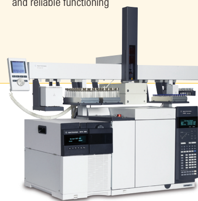
Agilent PAL Sampler